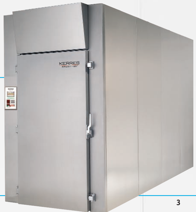
multi-truck universal smokehouse Fishmoker JS H-2850/4