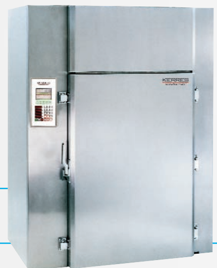
single-truck-unit Fishsmoker JS H-1950/1