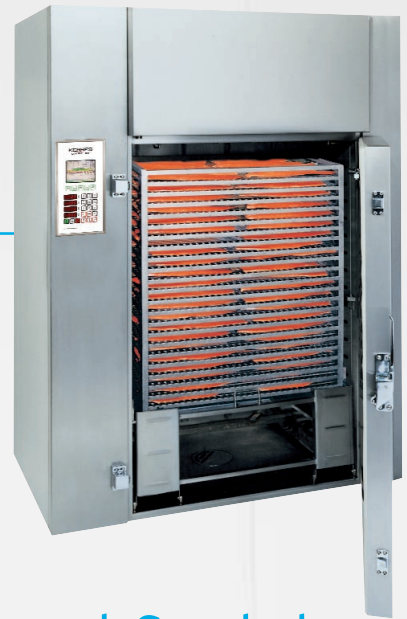
single-truck smokehouse Fishmoker JS H-2250/1