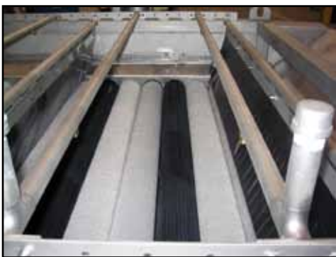
Optional spray bars and retention flaps.

Options include integral spray bars for wet scrub applications, drain pan, product retention flaps, discharge chute, and height extension riser.