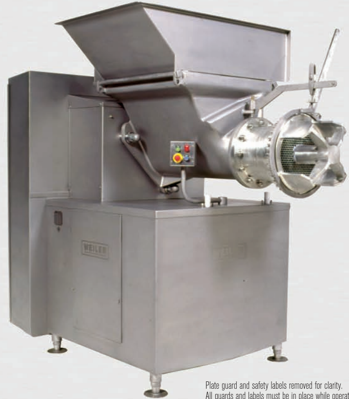
Plate guard and safety labels removed for clarity. All guards and labels must be in place while operating.

* Actual grind rate will depend on application specifications, including, but not limited to, reduction size, raw material and raw material temperature.