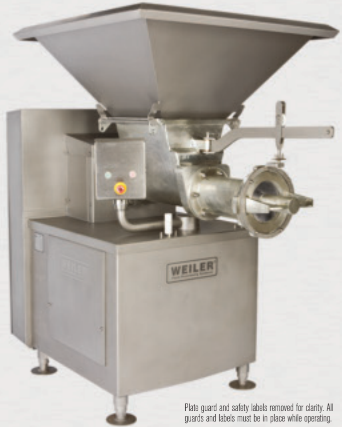
Plate guard and safety labels removed for clarity. All guards and labels must be in place while operating.

Built into the feedscrew for greater drive strength.