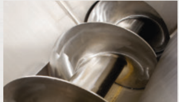
Polished food contact surfaces