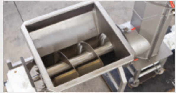
Hopper guard and safety labels removed for clarity. All guards and labels must be in place while operating.